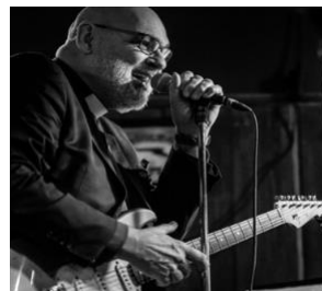
Kurt Ahnlund framträdde med gitarr och sång