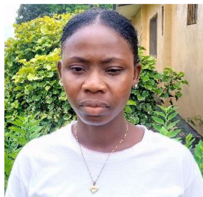
Princess Q.K. Toe