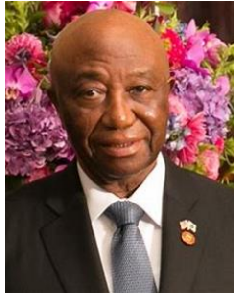
Challenger Joseph Boakai, former Vice President under Ellen Johnson Sirleaf

The people of Liberia will on next week Tuesday, November 14, 2023, go to the polls in a runoff election to decide who becomes President for the next six years. The race is between incumbent President George Manneh Weah of the Coalition of Democratic Change and former vice President Joseph Nyumah Boakai of the Unity Party. The two of them are in the race after either of them could not obtain the 50+1 percent as required by the constitution of Liberia.